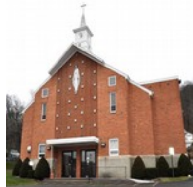
St. Mary of Czestochowa Church

hlychild@ptd.net www.holychildparish.com