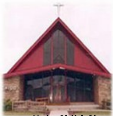
Holy Child Church