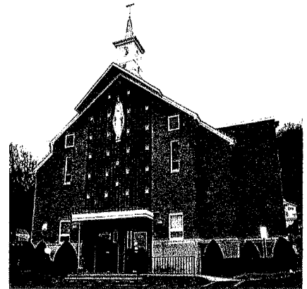
St. Mary of Czestochowa

hlychild@ptd.net www.holychildparish.com