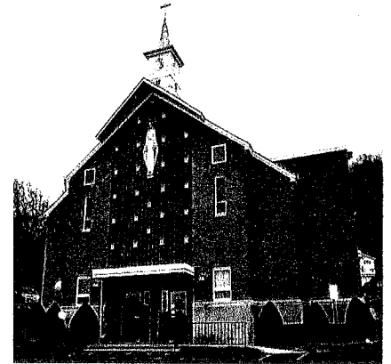
St. Mary of Czestochowa

hlychild@ptd.net www.holychildparish.com