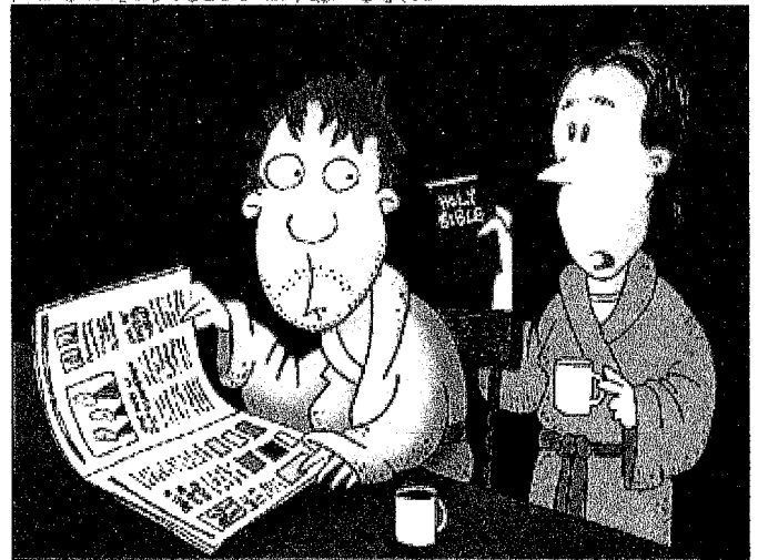
Thanks to Bill Soto