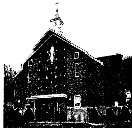
St. Mary of Czestochowa

hlychild@ptd.net www.holychildparish.com