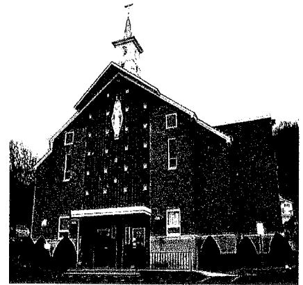
St. Mary of Czestochowa

hlychild@ptd.net www.holychildparish.com