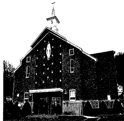
St. Mary of Czestochowa

hlychild@ptd.net www.holychildparish.com