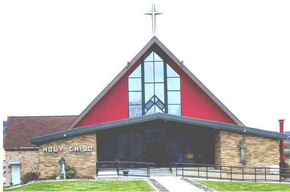
Holy Child Church 240 S Main St, Mansfield, PA