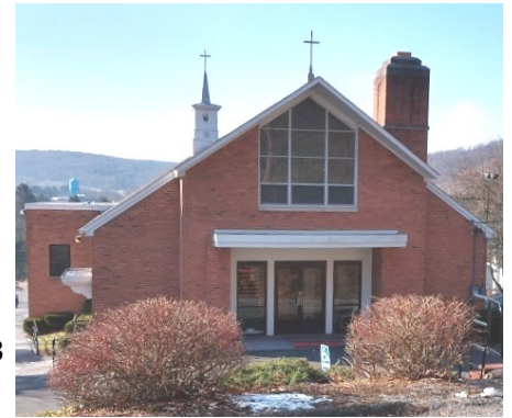
Saint Mary of Czestochowa Church 144 St Mary's St, Blossburg, PA