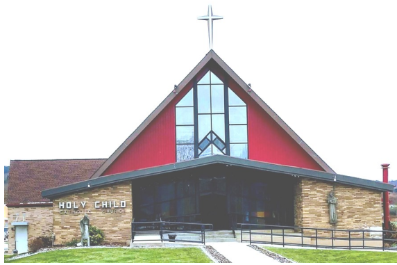
Holy Child Church 240 S Main St, Mansfield, PA