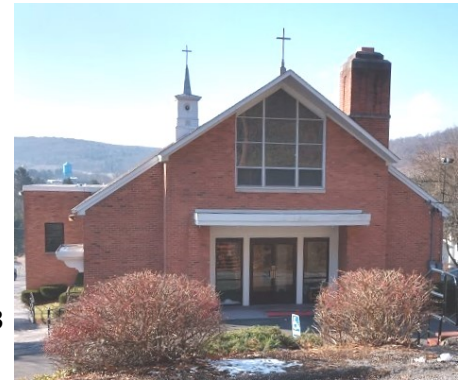
Saint Mary of Czestochowa Church 144 St Mary's St, Blossburg, PA