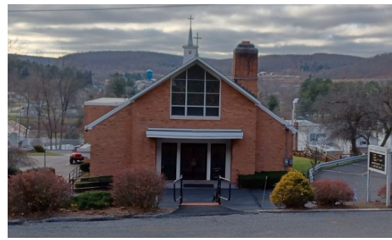
Saint Mary of Czestochowa Church 144 St Mary's St, Blossburg, PA