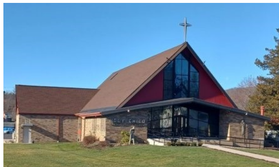
Holy Child Church 240 S Main St, Mansfield, PA