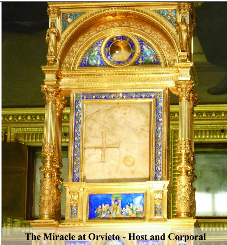
The Miracle at Orvieto - Host and Corporal

Inspired by the miracle, Pope Urban commissioned a Dominican friar, St. Thomas Aquinas, to compose the Mass and Office for the feast of Corpus Christi. Aquinas' hymns in honor of the Holy Eucharist, Pange Lingua , Tantum Ergo , Panis Angelicus , and O Salutaris Hostia are the beloved hymns the Church sings on the feast of Corpus Christi as well as throughout the year during Exposition and Benediction of the Blessed Sacrament.