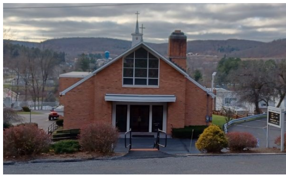
Saint Mary of Czestochowa Church 144 St Mary's St, Blossburg, PA