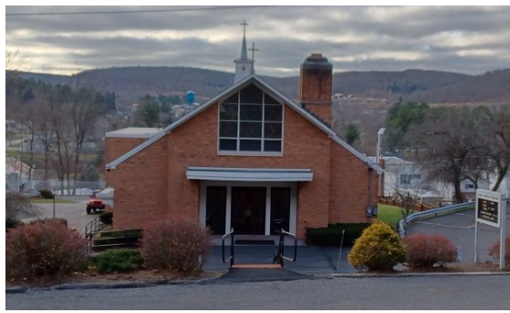
Saint Mary of Czestochowa Church 144 St Mary's St, Blossburg, PA