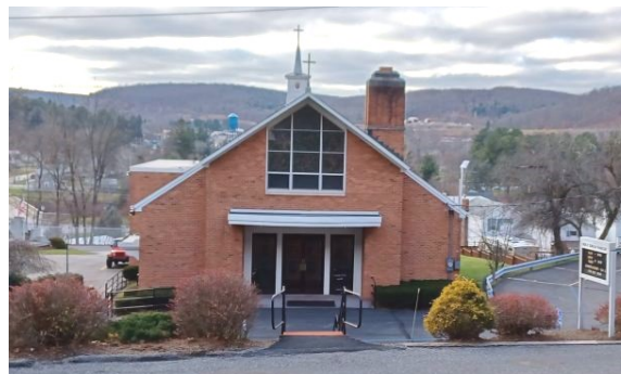
Saint Mary of Częstochowa Church 144 St Mary's St, Blossburg, PA

WEEKEND MASSES SATURDAY 4:00 PM, SUNDAY 11:15 AM