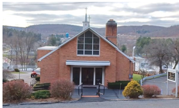
Saint Mary of Częstochowa Church 144 St Mary's St, Blossburg, PA

WEEKEND MASSES SATURDAY 4:00 PM, SUNDAY 11:15 AM