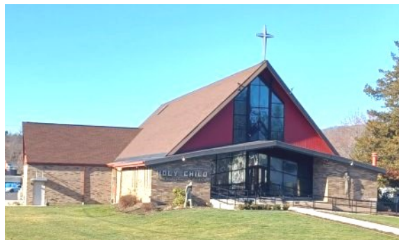
Holy Child Church 240 S Main St, Mansfield, PA