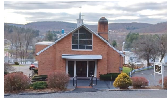
Saint Mary of Czestochowa Church 144 St Mary's St, Blossburg, PA