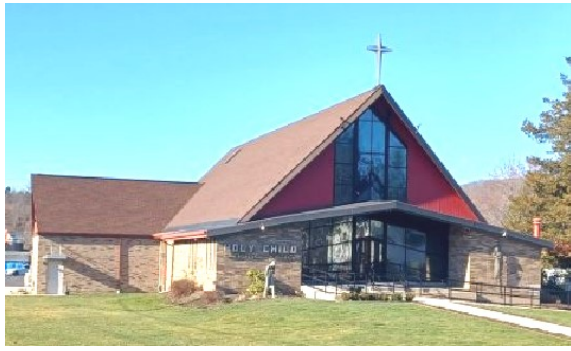
Holy Child Church 240 S Main St, Mansfield, PA