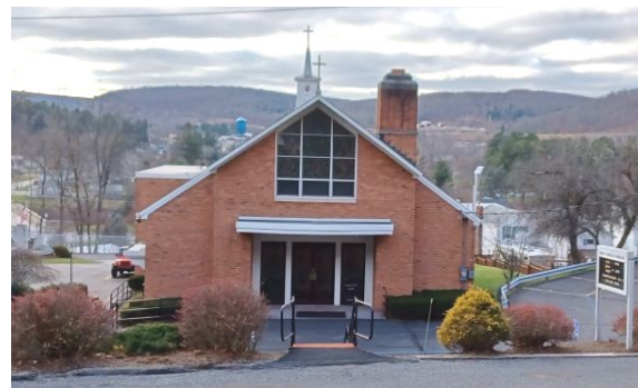
Saint Mary of Częstochowa Church 144 St Mary's St, Blossburg, PA