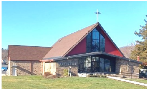
Holy Child Church 240 S Main St, Mansfield, PA