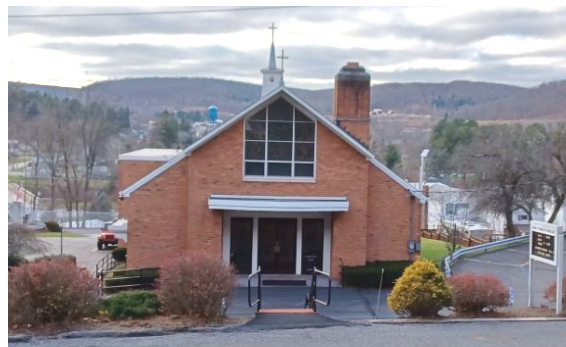
Saint Mary of Częstochowa Church 144 St Mary's St, Blossburg, PA