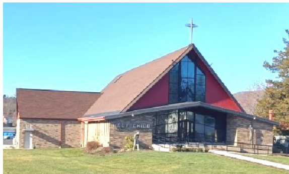
Holy Child Church 240 S Main St, Mansfield, PA