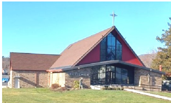
Holy Child Church 240 S Main St, Mansfield, PA