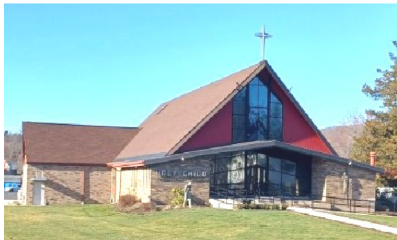
Holy Child Church 240 S Main St, Mansfield, PA