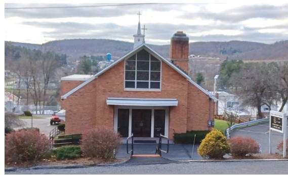
Saint Mary of Częstochowa Church 144 St Mary's St, Blossburg, PA