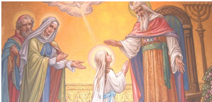
The Presentation of the Blessed Virgin Mary

The Church wants to emphasize not so much the historical event in itself, of which there is no trace in the Gos-